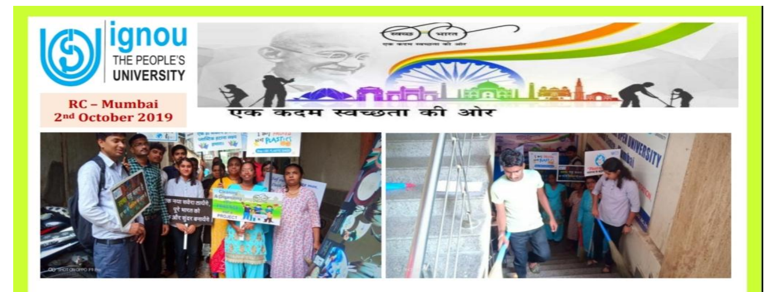
Cleanliness drive organized at premises of Regional Centre Mumbai