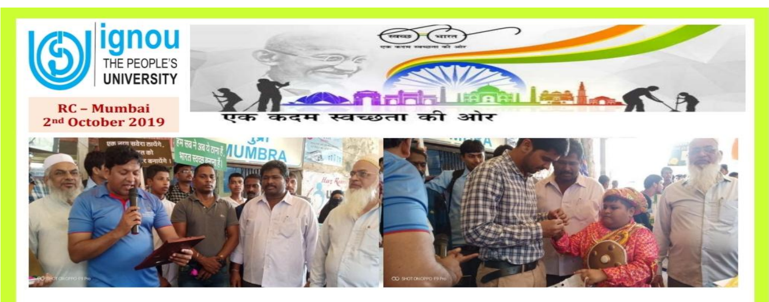
Cleanliness drive organized along with Ummeed Foundation at Mumbra Railway station. Special children of this foundation and RC staff has participated.