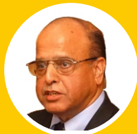
Padma Vibhushan Dr. K. Kasturirangan Chairman, National Education Policy -2020

National Education Policy (2020) - The Broad Contours